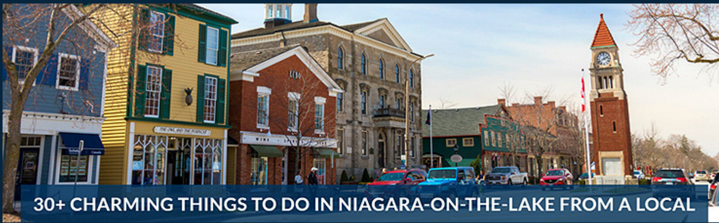
30+ CHARMING THINGS TO DO IN NIAGARA-ON-THE-LAKE FROM A LOCAL