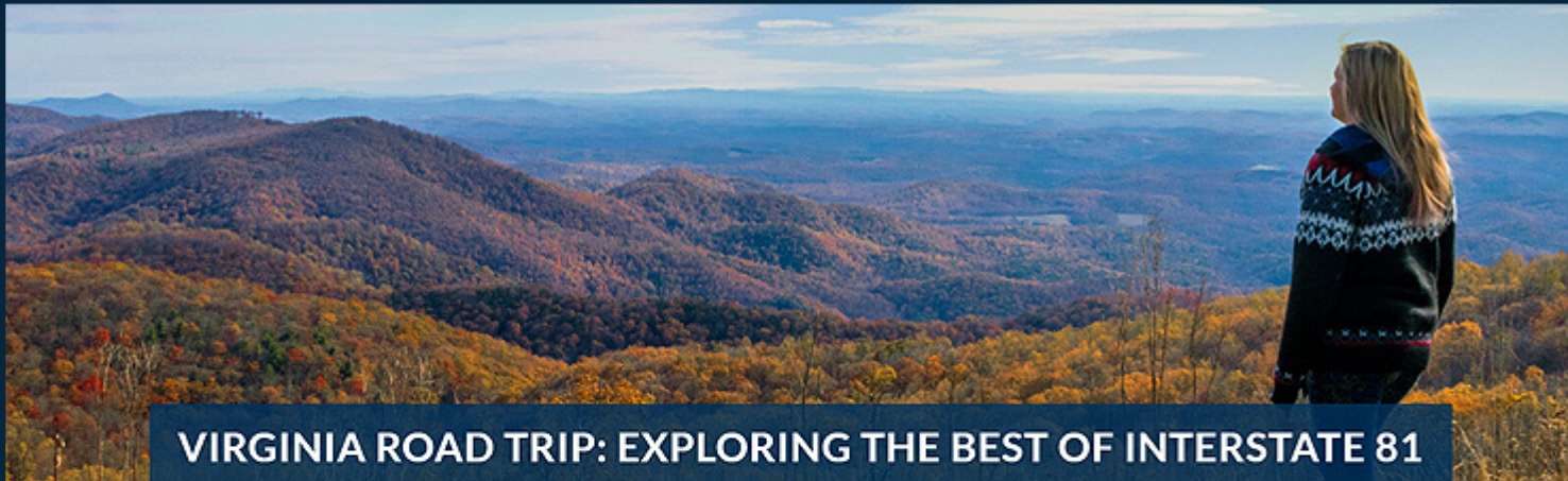
VIRGINIA ROAD TRIP: EXPLORING THE BEST OF INTERSTATE 81