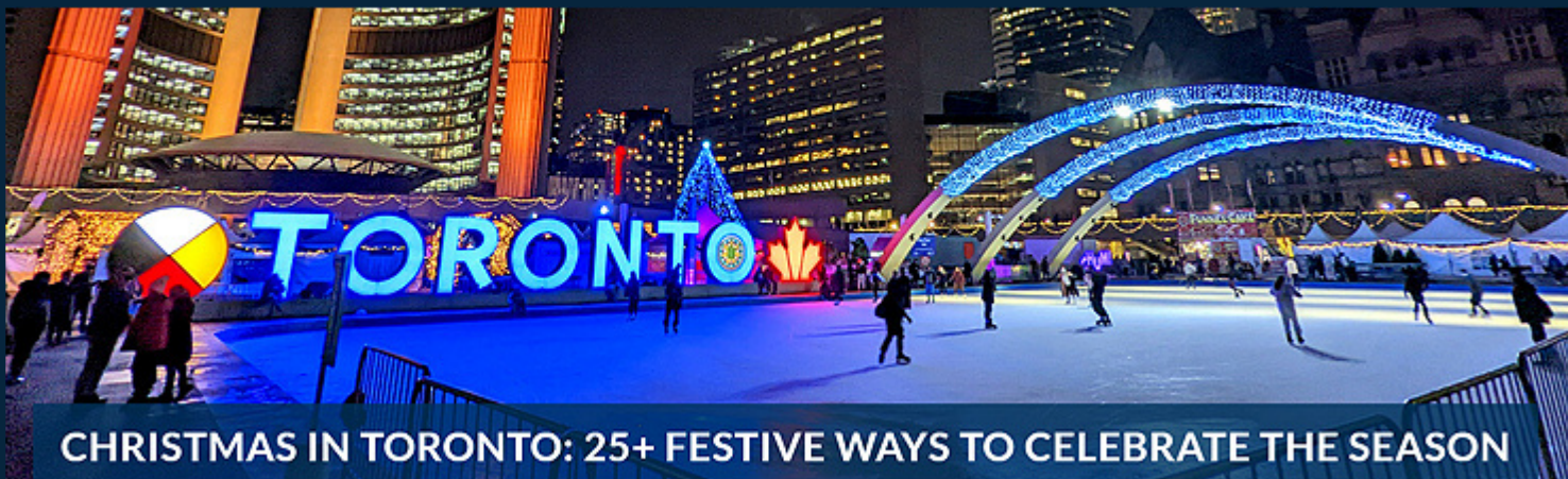
CHRISTMAS IN TORONTO: 25+ FESTIVE WAYS TO CELEBRATE THE SEASON