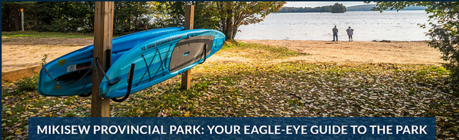
MIKISEW PROVINCIAL PARK: YOUR EAGLE-EYE GUIDE TO THE PARK