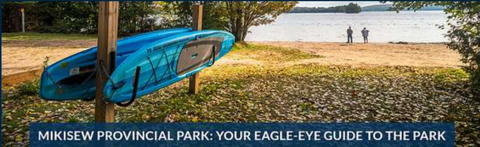
MIKISEW PROVINCIAL PARK: YOUR EAGLE-EYE GUIDE TO THE PARK