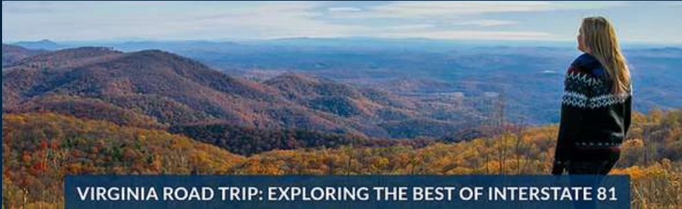
VIRGINIA ROAD TRIP: EXPLORING THE BEST OF INTERSTATE 81