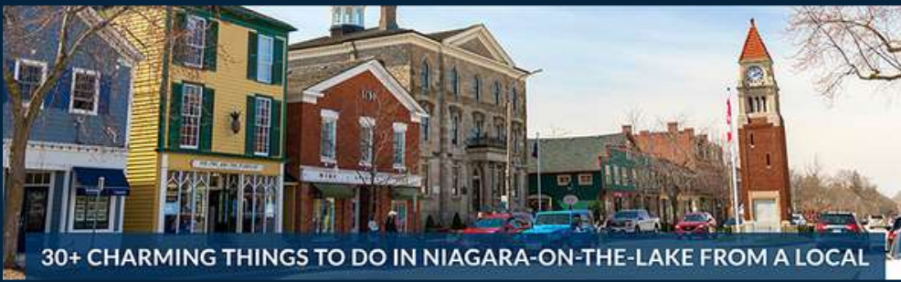
30+ CHARMING THINGS TO DO IN NIAGARA-ON-THE-LAKE FROM A LOCAL