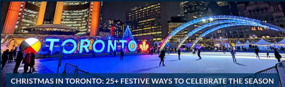
CHRISTMAS IN TORONTO: 25+ FESTIVE WAYS TO CELEBRATE THE SEASON